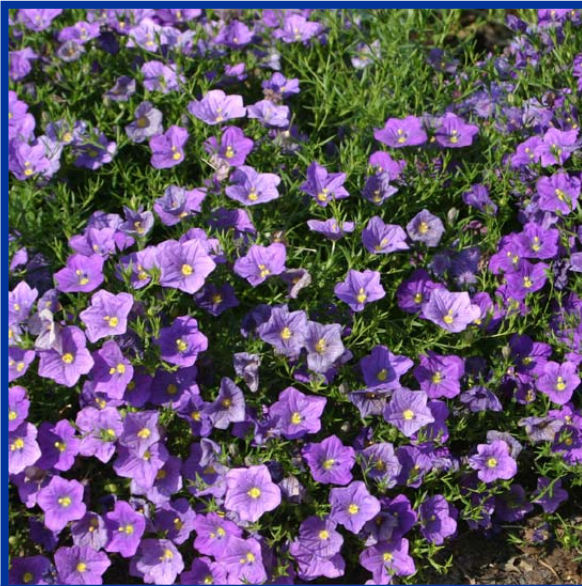
Cupflower produces mounds of blue or white, star-shaped, saucer-like flowers.

What is cupflower? Nierembergia , commonly known as cupflower, is a genus of tender, heat-loving perennials in the nightshade family (Solanaceae) that is valued for its long blooming period. The genus, which is native to Argentina, is named for Juan Eusebio Nieremberg, a 17 th century Spanish Jesuit theologian and naturalist.