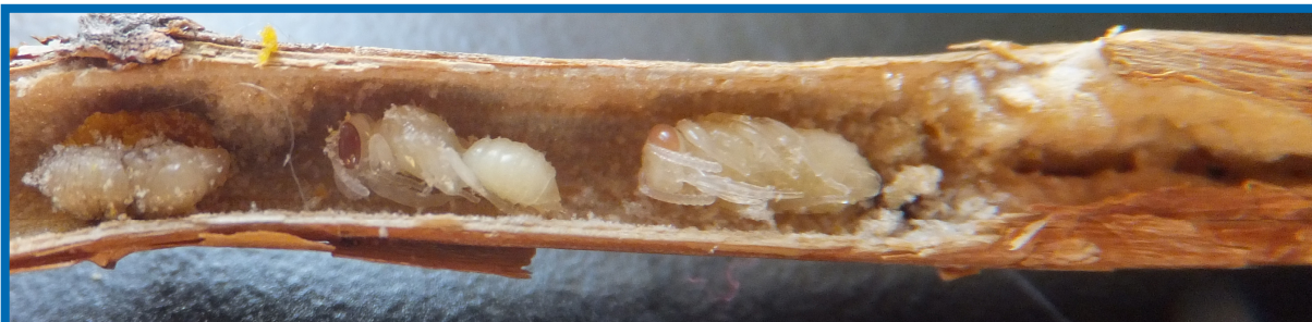
Some native solitary bees nest in hollowed out branches or twigs.

Cultivating flowering plants: Provide food and nesting habitat for bees by landscaping with flowering plants. Unused areas of a lawn can be converted into pollinator habitats. Provide a diversity of plants that will bloom from early spring (when some bees start to emerge) to late fall (when some bees such as bumblebee queens are preparing to overwinter). Plants that are especially good for bees include pussy willow, plum, cherry, blueberry, New Jersey tea, American basswood, wild lupine, anise hyssop, purple prairie clover, pale purple coneflower, wild bergamot, Culver's root, butterfly milkweed, woodland and prairie sunflower, prairie blazing star, great blue lobelia, showy and stiff goldenrods, and smooth blue aster. In addition, common garden herbs such as spearmint, oregano, sweet marjoram, basil, borage, lavender and catnip/catmint are very attractive to bees.