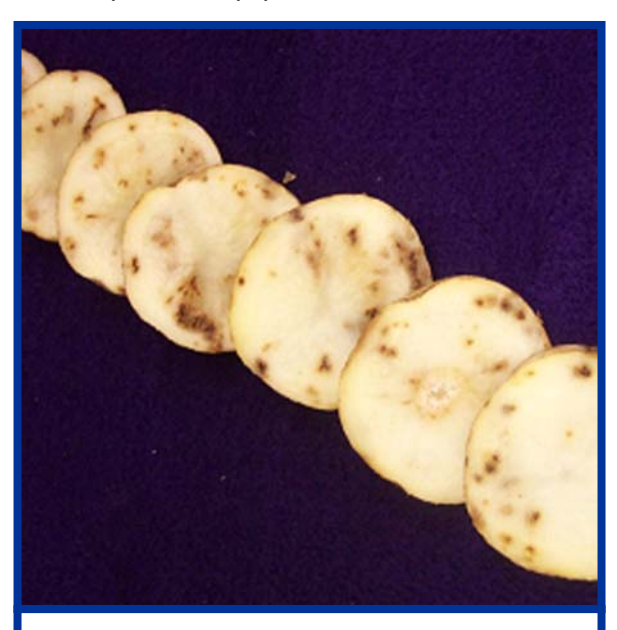
Internal necrosis of tubers, often in fleck or arc patterns is typical of corky ringspot.

What is corky ringspot? Corky ringspot (also known as spraing) is a potentially serious viral disease of potato that has recently been detected in Wisconsin. The disease can cause severe losses due to the fact that it reduces potato tuber quality, making tubers unsuitable for use in potato chip production and undesirable to consumers as table stock. Variants of this