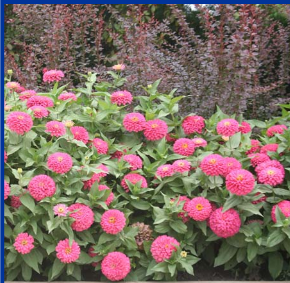
Zinneas can be effectively used in gardens as an edging plant.

Z. pauciflora (synonym Z. peruviana ) grows up to 30 inches tall and produces 1½-inch-wide, single, red or yellow flowers with button-like centers. This zinnia is good for cutting and drying, and has powdery mildew resistance. Only varieties 'Bonita Red' and 'Bonita Yellow' are readily available.