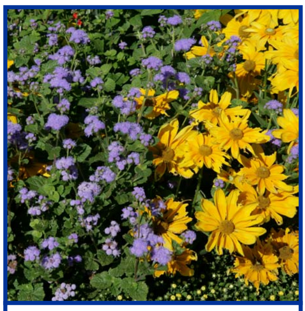
Blue-flowered ageratum pairs well in the garden with yellow-flowered ornamentals.

weeks before you would like to transplant them into your garden. Surface sow the seeds, barely covering them with vermiculite or potting mix. Be sure that the seeds receive light to stimulate germination. Germination usually takes seven to 21 days. Transplant the seedlings into trays or pots when they are large enough to handle. Move potted plants outside to harden off and transplant them into the garden when all risk of frost has passed.