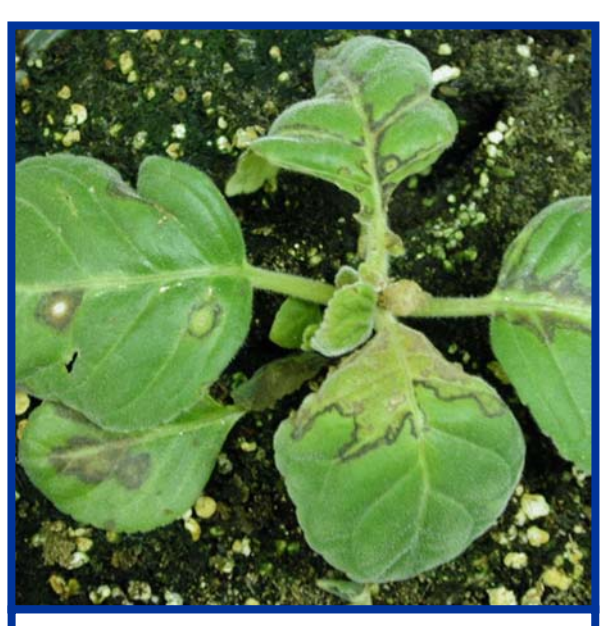
Symptoms of impatiens necrotic spot on Gloxinia.

How do I control impatiens necrotic spot in the future? Impatiens necrotic spot control measures concentrate on excluding INSV and preventing its spread. Inspect any plants entering a greenhouse (e.g., new plant shipments, plants moved in from outdoors) for viral symptoms and thrips. Isolate new plants