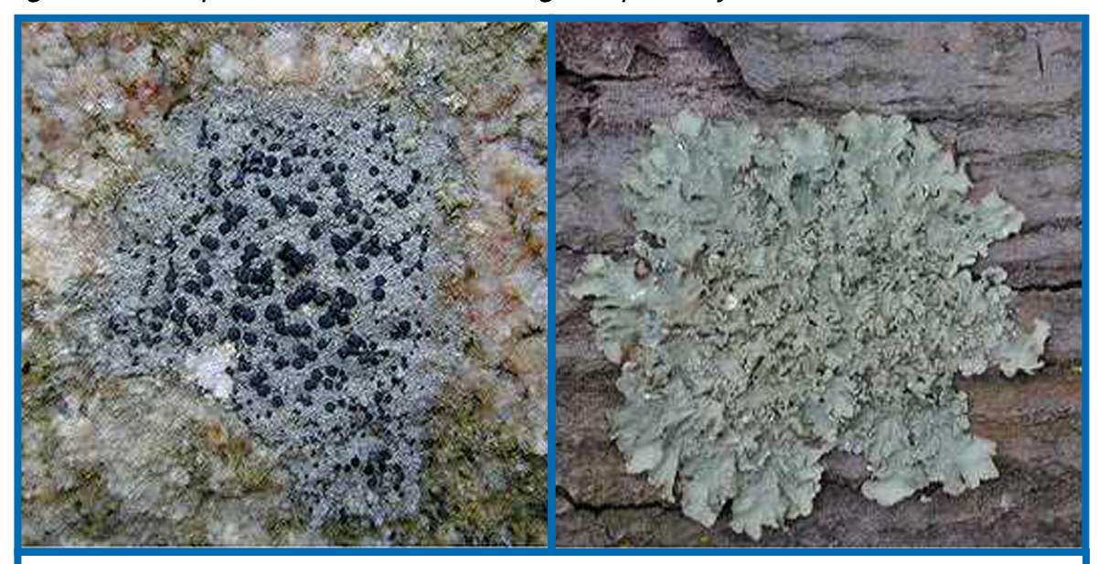
There are many types of lichens. Crustose lichens (left) are crust-like and adhere tightly to the surface upon which they grow. Foliose lichens (right) are leaf-like and composed of flat sheets of tissue that are not tightly bound.

What are lichens? Lichens are organisms that arise from mutually beneficial interactions between certain fungi and algae. The fungi provide the physical structures of the lichens, as well as protection for the algae. The algae, in turn, produce food for the fungi via photosynthesis.