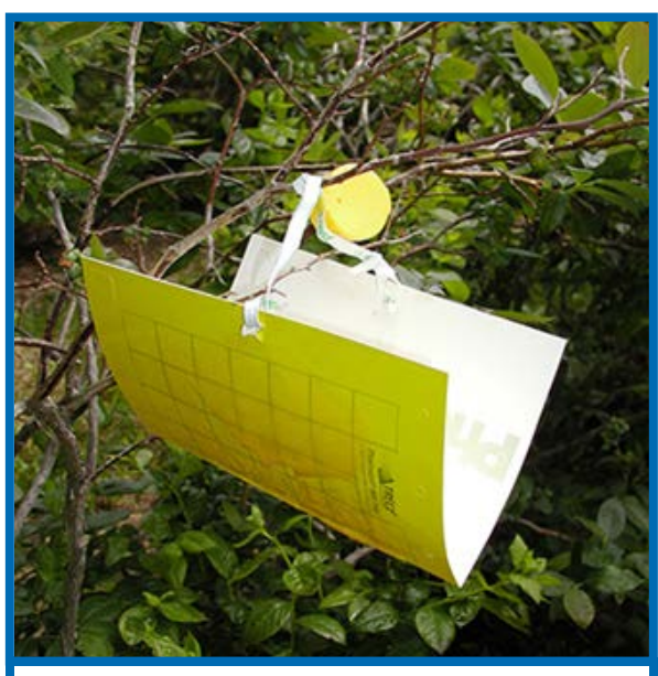
A blueberry maggot trap.

Once you have detected adults, you can also test fruit for the presence of larvae. Collect 100 berries from throughout your planting. Then break the skins of the berries and mix the berries with a salt-water solution (1 part salt to 4 parts water). Larvae will float to the surface. The number of larvae you find represents the percentage of fruit infested.