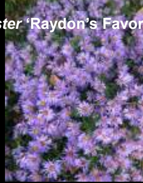
Aster 'Raydon's Favorite'