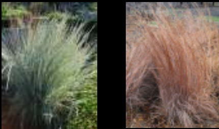
Schizachyrium 'The Blues'