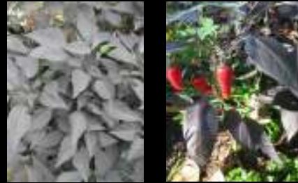
Capsicum 'Count Dracula'