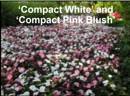
'Compact White' and 'Compact Pink Blush'