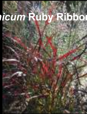
Panicum Ruby Ribbons™