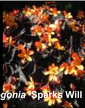
Begonia 'Sparks Will Fly'