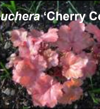
Heuchera 'Cherry Cola'