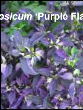
Capsicum 'Purple Flash'