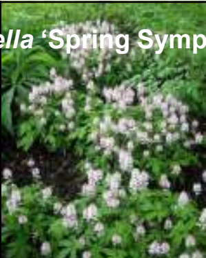
Tiarella 'Spring Symphony'