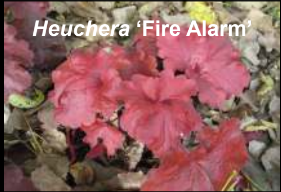
Heuchera 'Fire Alarm'