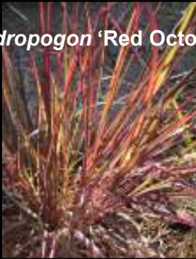
Andropogon 'Red October'