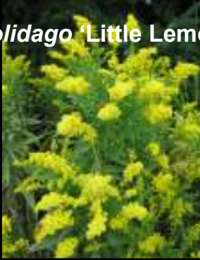
Solidago 'Little Lemon'