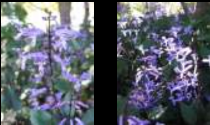
Plectranthus Mona Lavender™